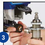
3 Remove hose and suction tube