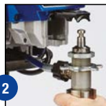
2 Open door and remove pump