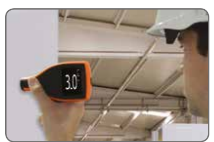
360° auto rotating display for a clear reading at any measurement angle, on the production line or QA station.

Automatically switches between ferrous & non-ferrous substrates<sup>1</sup>