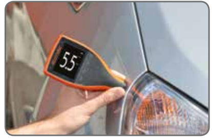
360° auto rotating display for measuring at any angle