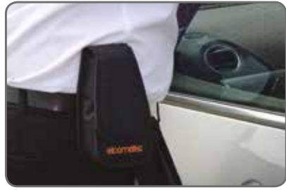
Durable & impact resistant case clips straight on to your belt