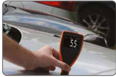
Measures on steel & aluminium body panels 2